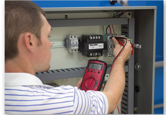
Voltage Check Using Multimeter

The 850-MT6B includes heavy-duty industrial components such as a 3-phase, 1/3 HP motor; disconnect switch; side rotary limit switch; manual shut off valve; emergency stop button; push-to-test buttons; and much more all on a mobile workstation! These industrial components can be used to practice an array of hands-on skills like installing a terminal block in an electrical panel; splice motor leads using ring lug connectors; bundle wires in an electrical panel; manually operate an electro-pneumatic valve; and select circuit protection for an application. These real-world components will allow learners to gain confidence and competence in working with equipment they'll actually see on the job.