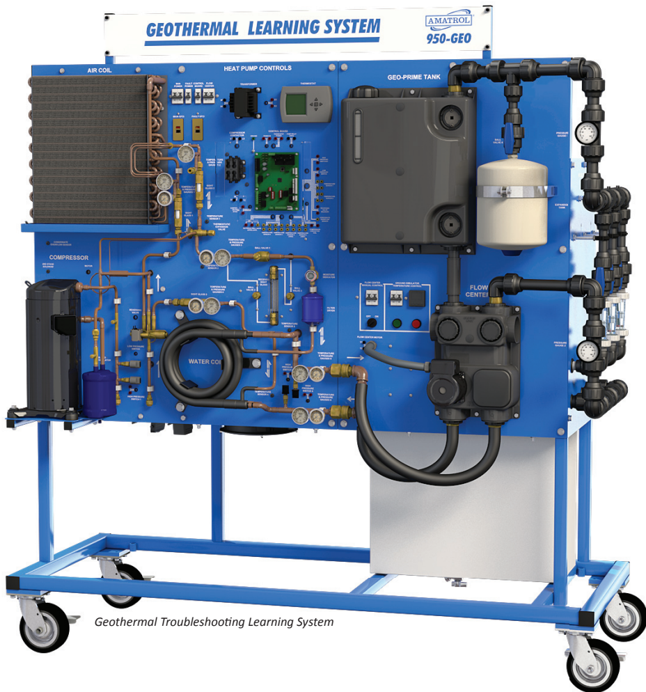
Geothermal Troubleshooting Learning System

Amatrol's Electronic FaultPro Troubleshooting