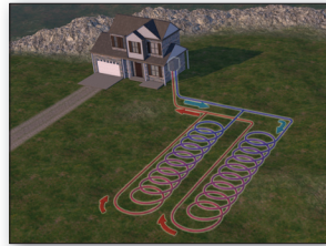
Simulates Ground Source/Sink

Amatrol's 950-GEO2's ground simulator is a temperature-controlled system that creates a constant temperature which allows the system to operate continuously. A digital, programmable temperature control unit is used to set and maintain the ground simulator at the desired temperature, resulting in both accurate data collection and continuous operation.