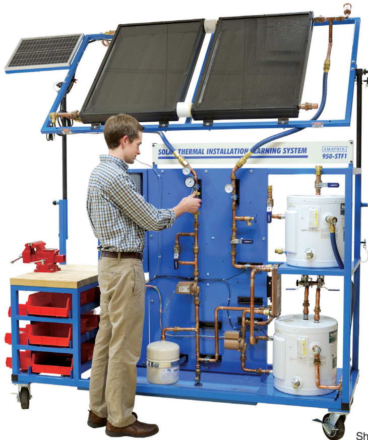
Shown with option 95-STF2

The demand for qualified Solar Technicians is rising, as more consumers and businesses apply solar energy in their communities. Many employers are requesting NABCEP (North American Board of Certified Energy Practitioners) certification or equivalent skills as a condition of employment. Amatrol's Solar Thermal Installation Learning System supports the learning necessary to prepare for portions of NABCEP certification and helps to prepare students for successful employment in the solar thermal industry field.