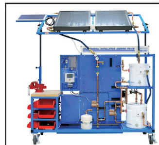
Closed-Loop Drainback System