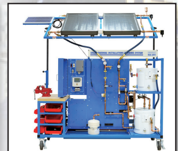
Open-Loop Drainback System

performed quickly and all-inclusive at the workstation with the use of bench-top workspace, table vise, and system installation panel. Silk screened shadow boards provide inventorying for easy access and storage.