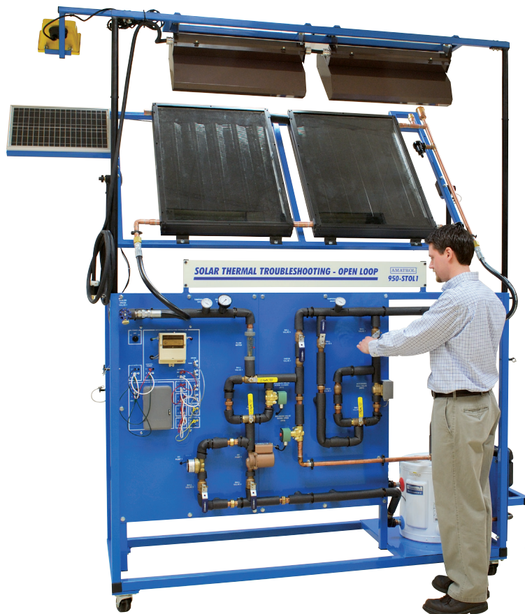
Shown with optional sun simulator

Installing and maintaining solar thermal open-loop systems require hands-on skills and troubleshooting ability across both drainback and pressurized systems. Likewise, engineers and designers need to understand the technologies used in these systems as well.