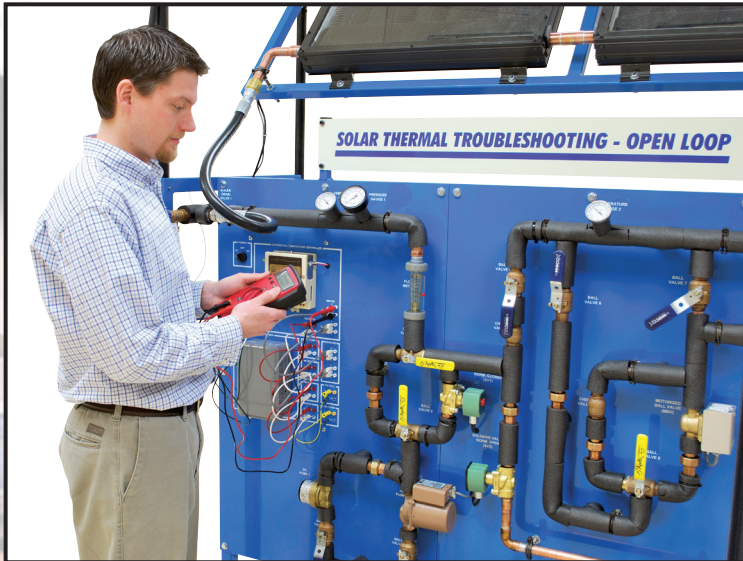
Student Reacting to Electrical Fault

At the heart of a technician's skill set is the ability to troubleshoot a system. The 950-STOL1 is equipped with a wide array of both electrical and fluid faults that allow instructors to replicate realistic system and component failures students. Students will learn to independently solve the many common types of situations they will encounter on the job.