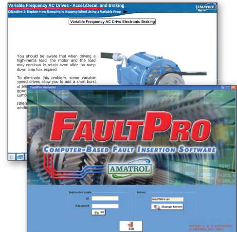
Portable AC Motor Drive Troubleshooting Learning System