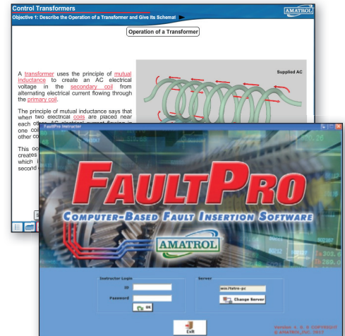
Includes FaultPro Software and Interactive eLearning