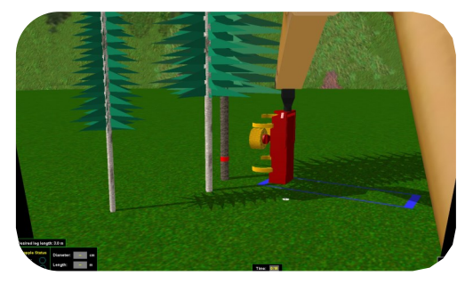
Driving the tracked carrier and selective harvesting

Mastering the basics of the complete Cut-To-Length cycle