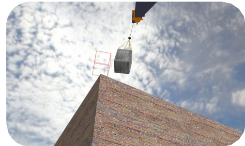
Positioning loads at target positions while avoiding obstacles