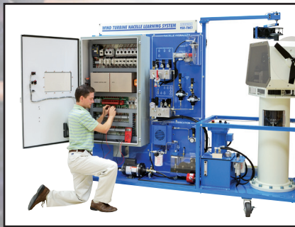
Student Troubleshooting Electrical Fault

Wind turbine technicians must have good troubleshooting skills. At the heart of teaching troubleshooting skills is the ability of an instructor to create realistic problems or faults that students must identify and resolve. It is what they will have to do, by themselves, on top of a wind turbine tower. The 950-TNC1 includes over 30 faults distributed across all key subsystems – electrical, mechanical and hydraulic. This will allow instructors to create realistic troubleshooting situations that a wind turbine technician will encounter on the job.